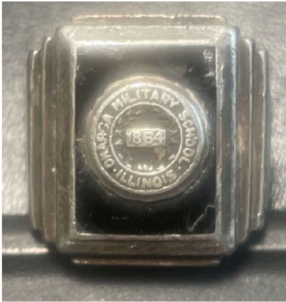
OMS CLASS RING

Does any of our membership recognize this OMS class ring? It was found on the banks of the James River near Richmond, Virginia, on/about 2008. The only markings are a very vague jeweler's mark and STERLING impression. A thorough search of School Yearbooks and Onargosy Newsletters revealed a likely purveyor. In the earliest reference on file, the 1922-1923 Purple & Gold Yearbook , its Advertiser listing shows " Spies Bros Manufacturing Jewelers, Makers of O. M. S. Class Rings, 27 E. Monroe St., Chicago ". There is no mention of the 1923 class having received any class rings; so there is no confirmation that this ring is from that year. If anyone can offer additional information about this style class ring for GPS or OMS, please share.