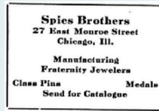
Spies Brothers - Chicago - 1921