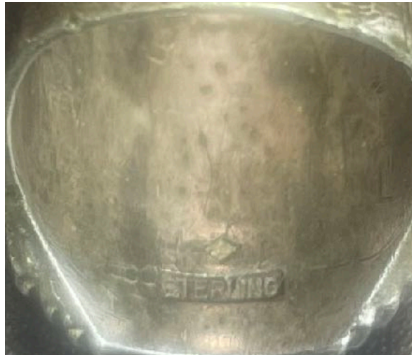
INSIDE STERLING IMPRESSION