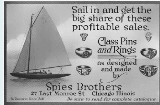
Spies Brothers - Chicago - 1919