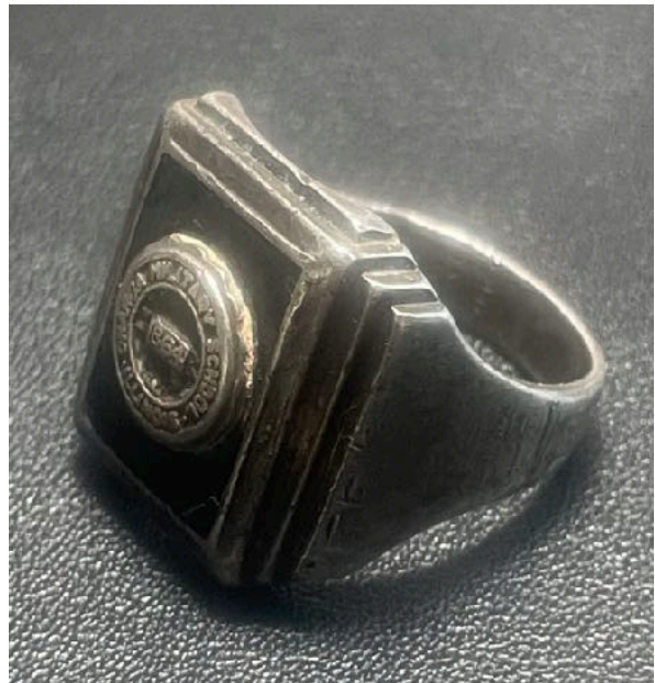
ART DECO STYLE RING