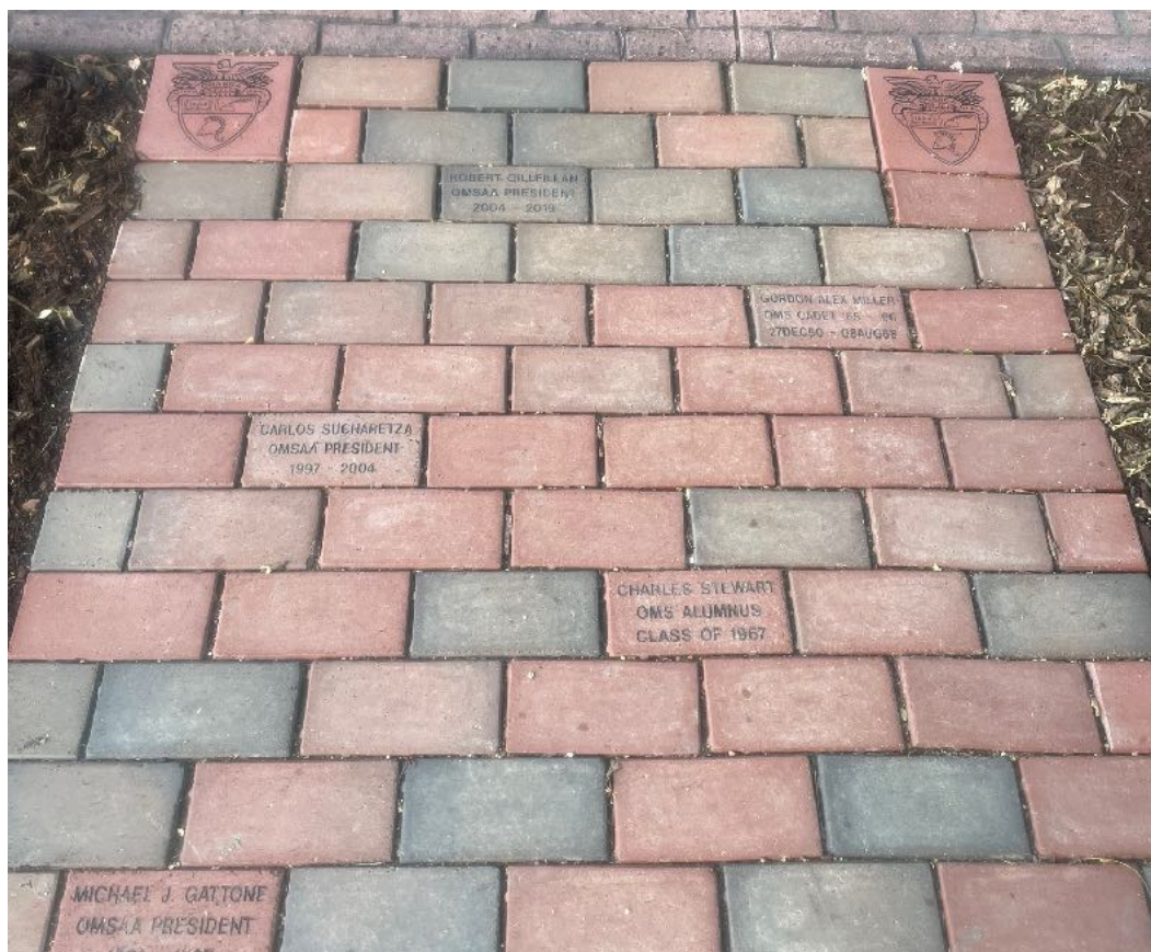
OMS EMBLEM BRICKS LOCATED IN EACH CORNER

HONOR A CLASSMATE, PATRON, TEACHER - BUY A BRICK